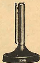
Models G, UG8