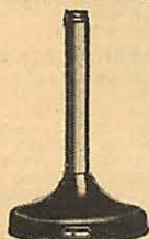
Models E-5-G, E-5-B